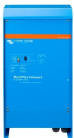
MultiPlus Compact 12/2000/80

When connected to the Ethernet, systems with a Color Control panel can be accessed remotely and settings can be changed.